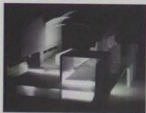
Structural and lighting model.